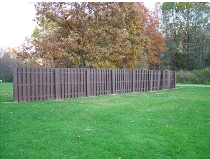
North Fence.