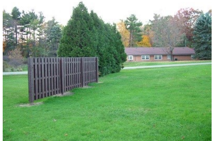
South Fence.