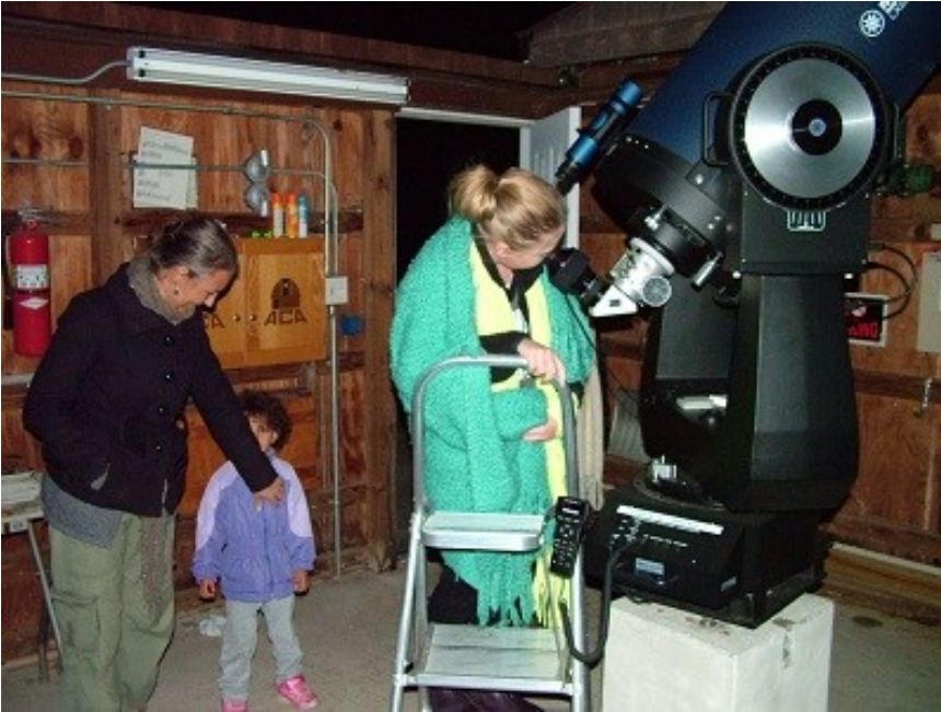
Homeschool student observes Herschel's Double Cluster through 16" observatory telescope.

with perfect skies and a 5-day old Moon that was in the sky for about half of the star party. We had a very good turnout of stargazers to view Moon, Neptune, Uranus, Andromeda Galaxy, ET Cluster, Cat's Eye Nebula, Blue Snowball, M15, M2, M11, and more.