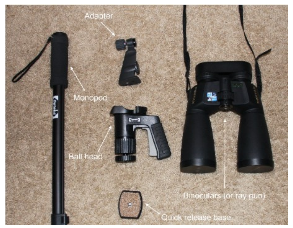
The essential components of a binocular monopod mount for steady, quick, and easy observing with high power binoculars.

When I put it all together it improved my quick observing sessions immensely. Just give the grip a squeeze to adjust. The moment you release the squeeze the binoculars are locked into the new position. The monopod height is quickly adjusted too. The main thing to remember is to put one hand on the monopod and one hand on the pistol grip. Keep your elbows low and close to your body while you relax your arms and shoulders. You would be surprised how wobbly you are if your elbows are raised and your arm muscles are tense.