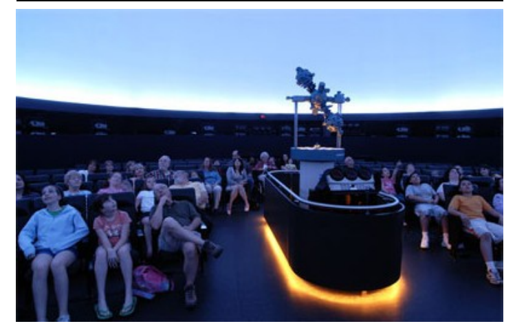
The Skymaster ZKP3/S projector in the Shafran Planetarium, Cleveland Museum of Natural History.

We look forward to seeing you at all Club functions!