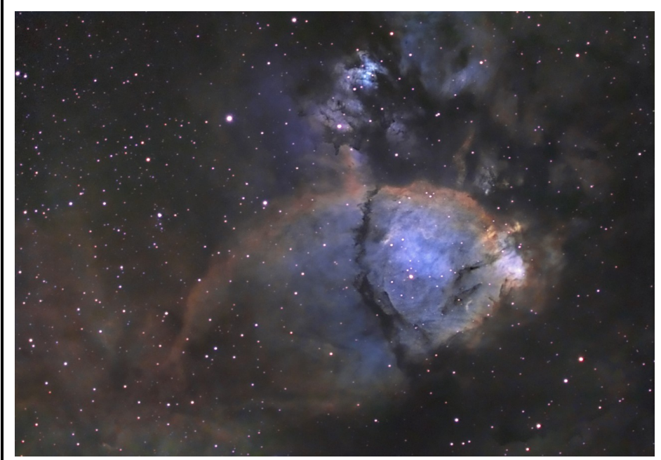
Nebula NGC896 by Peter Clausen. Imaged with a Meade DSI Pro III, an Orion 102mm f/7 ED Refractor on an Atlas EQ6 mount. Exposures of 5 h Ha filter, 3 h OIII filter, and 3 h SII, 11 hours total. SII combined to Red, Ha combined to Green, and OIII combined to blue.

First, use the bulb-type puffer to blow off any dust or loose particles from the lens surface. Don't blow the dust off with your mouth, as droplets of moisture can get on the lens, causing spots. If the eyepiece or objective lens has particles stuck to it that can't be blown off, moisten (do not soak) a tissue with Windex and gently blot the surface, without