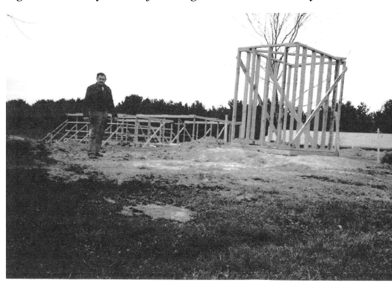
Figure 2-Jimmy Wood framing in the observatory

Outreach requests (I haven't heard from anyone on these outreach requests):