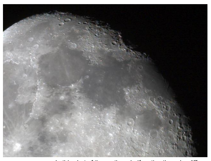
Photo #2 In this shot of the northern half, notice the color difference between Mare Serenitatis on the left and Mare Tranquillitatis just to the right. Several photos verified this difference. Light brown to a bluish grey.