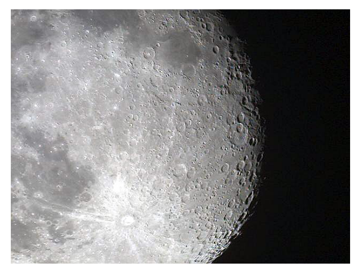
Photo #1 Note the bright ray extending from Tycho north to Mare Crisium