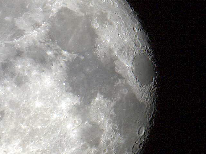
Photo #3 Mare Crisium appears at the terminator. Cleomedes crater is on the northern rim and Langrenus crater can be seen directly south.