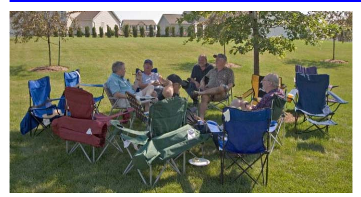
Strangely enough, chairs (and people) seemed to accumulate in one area at the picnic.