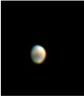
Picture of Mars imaged by John Shulan with Nexstar 8i, 1000 stacked images taken with Celestron Nextimage CCD camera.

The conjunction of Venus and Jupiter provides a backdrop for an observing session at Fishcreek school.