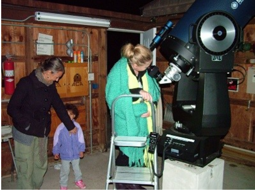
Homeschool student observes Herschel's Double Cluster through 16" observatory telescope.

Our last scheduled star party of the year was on October 22nd. We had a Cub Scout group show up as well as many others interested in looking at the night sky. All were treated to clear skies with excellent seeing conditions. The following week we held a private star party for Cuyahoga Falls Cub Scout Pack 3161 on their scheduled Monday night pack meet. Since the skies were cloudy, we set up a slide show presentation that lasted about an hour. The kids were very interested in learning about planets & stars and asked the traditional questions about black holes and worm holes. On November 6th we held another private star party for a homeschool group. We started off with a presentation on astronomy and then continued with an observing session. The skies were clear and the students got to see the Moon and many deep sky objects. This is the groups' second visit to the observatory to learn about stars. Thanks to Tom Alexander for setting up his telescope for both private star parties. We had an impromptu star party on November 4th