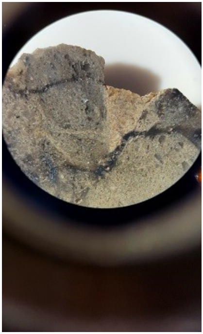
NWA 8687 lunar troctolite under a microscope. Note the lighter tan triangle material surrounded by the greener melt area and some very feint metal veins within the lighter material.