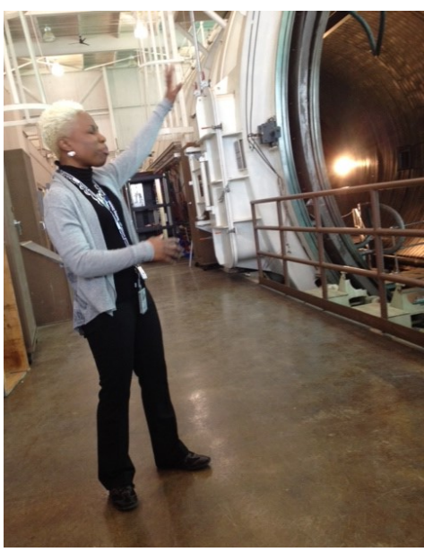
(left) The back of the Flight Research Building. This is the first building you see when you pull up at Cleveland's Glenn Research Center. (right) Our tour guide shows us the largest vacuum chamber at Glenn Research Center.

chamber to draw out air molecules. After the roughing pumps have decreased the air pressure another set of pumps, called roots pumps, activate. These pumps remove air by two symmetrical objects rotating in the opposite directions until the air pressure in the tank approaches that of fifty miles above the earth. At this point, oil diffusion pumps directly under the tank begin to operate. When these pumps are activated, a boiler electrically heats oil until it vaporizes and rises through chimneys. The gas then emerges from nozzles at supersonic speeds and downward, capturing air molecules and carrying them down. The air then travels through pipes to the roots pumps. With all three of these pumps the environment in the tank is equivalent to that of being one hundred and ten miles above the earth. The last pump used to reach a higher vacuum for thruster testing is called a cryopump. This pump condenses molecules which then stick to the cryopanels inside the tank and freezes them. Some of the chambers are even outfitted to simulate other natural phenomenon encountered in space such as sunlight, cold, and electrical charges.