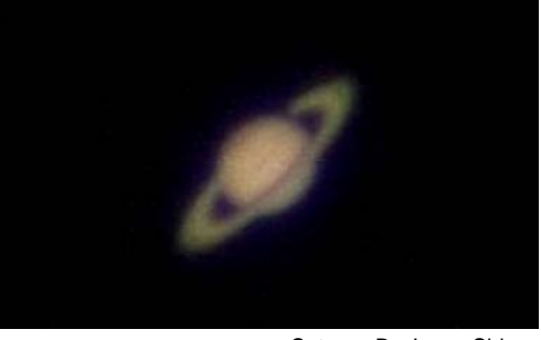
Saturn - By Jason Shinn Single Frame Image March 29, 2007 10pm Canon Digital Rebel XT ISO1600 1/10exp 6 inch Meade LXD-55 refractor

The Clavius / Schiller Region March 29, 2007 10pm Eighteen stacked images. Eyepiece projection 160 x 6 inch 1200 mm Meade LXD-55 refractor / 7.5 mm Orion Ultrascopic eyepiece Canon Digital Rebel XT ISO 1600 / 1/100 sec