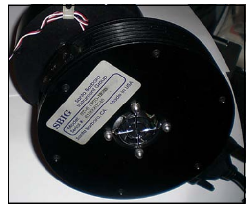
By John Crilly

Images, from top to bottom: SBIG ST-6; business end of ST-6; control box; CFW-6.